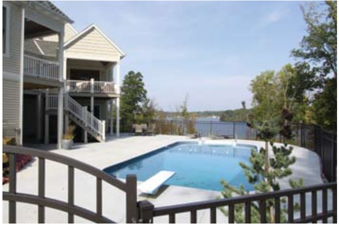
ABOVE: The covered patio overlooks the pool, pond, lake and woods. BELOW: The pool completes the homeowner's desire for the perfect place to enjoy friends and family.

Appliances: GERRIT'S APPLIANCE Building Materials: STANDALE LUMBER